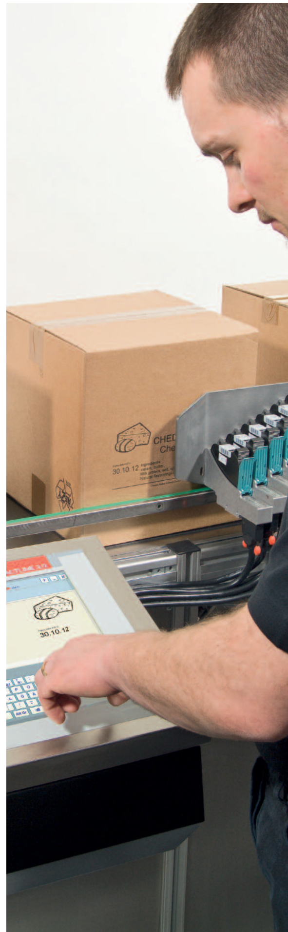
[ Thermal Inkjet Coder ]